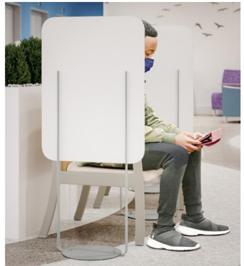
White HDPE Divider