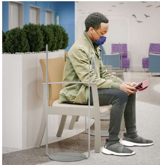
Transparent Polycarbonate Divider